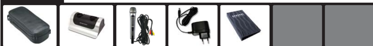
Carry Bag Stand Main MIC AC Adaptor Handbook (Manual / Song list)

2 If you find any of the items above missing and/or damaged, please contact the store where you purchased the product from immediately.