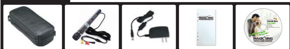
Carry Bag Main MIC AC Adaptor Karaoke Handbook (Song list & User's Manual) USB Installation CD

2 If you find any of the items above missing and or damaged, please contact the store where you purchased the product from immediately.