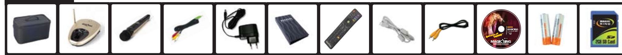
Carry Bag Main Station Wireless Karaoke AV Cable (RCA) AC Adaptor (DC 9V/1A) Karaoke Handbook (Song list & User's Manual) Remote Control USB Cable Video Cable USB Installation CD Battery SD card

2 If you find any of the items above missing and or damaged, please contact the store where you purchased the product from immediately.